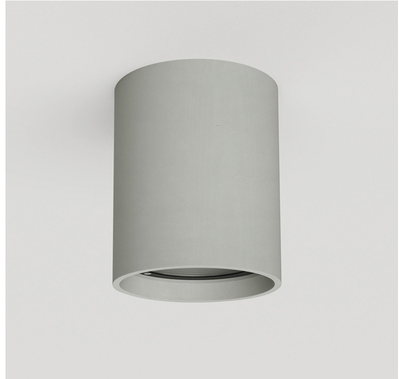
AVAILABLE FINISH: SHOWN IS 4"